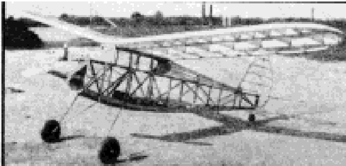
The structure is simple but strong