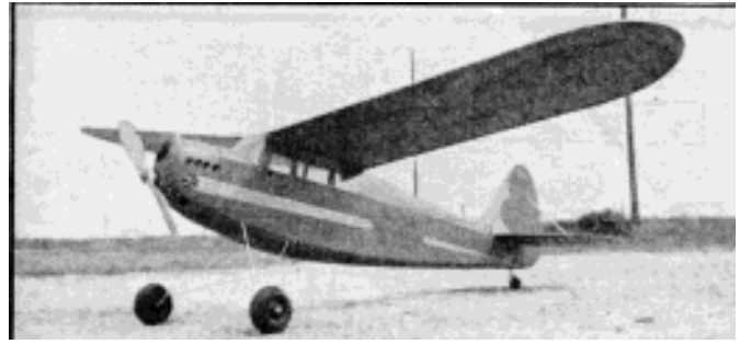
The finished plane is extremely realistic