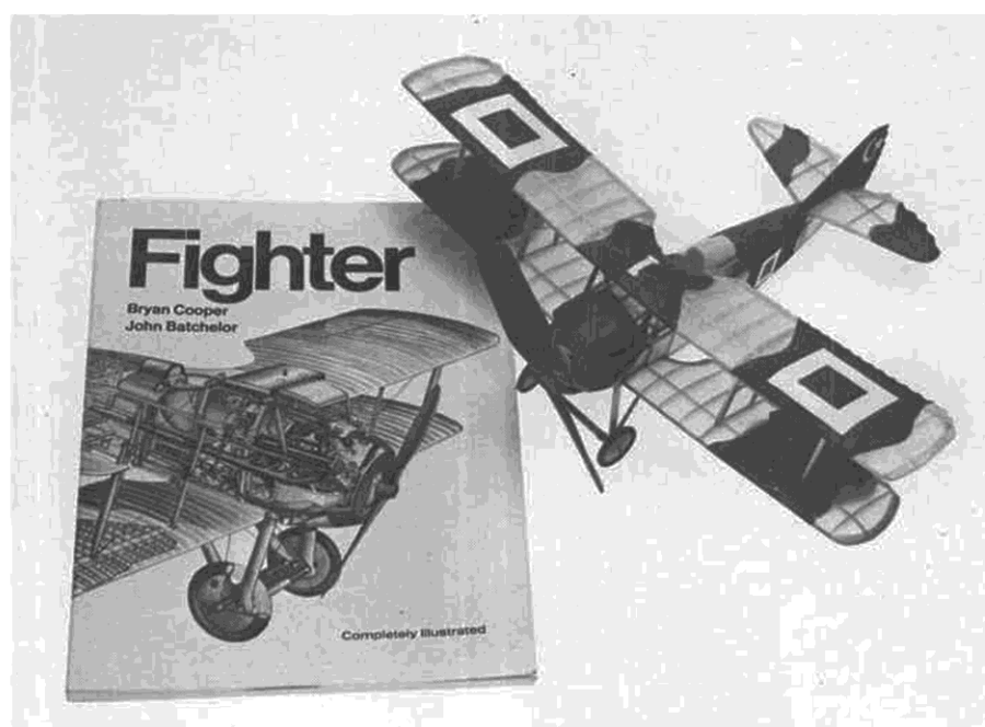
Nose moment of the Spad is short, but with a plastic, or carved bass prop, note too much ballast will be needed. A small blob of clay can be seen under the cowl in the top photo.