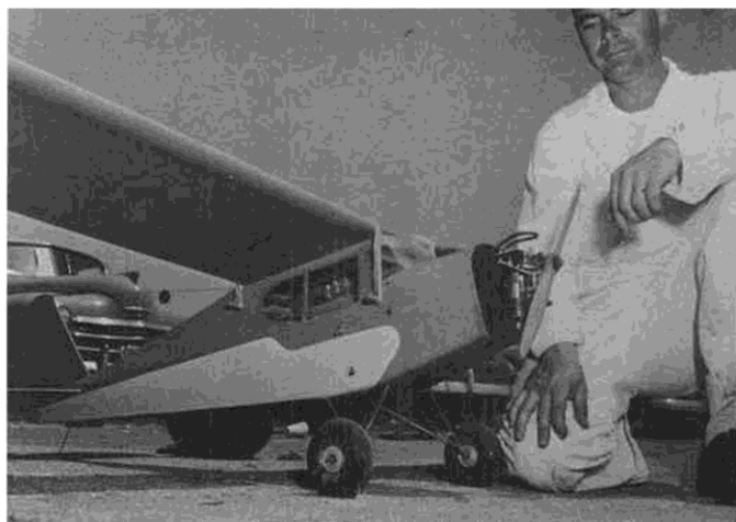
Spitfire .60 on ignition powered Schneider's Cubs. Note 3-tube receiver in cabin. Tubes rubber-banded to prevent vibration failures.