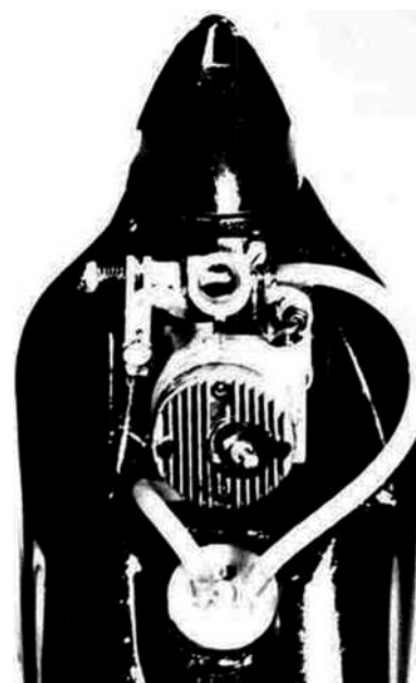
This shot shows how spray bar was filed down to enlarge air intake. Sullivan slant tank handy.