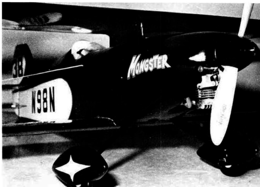
Mongster's name is yellow Monokote on red Monokote background. Pylon strut simplifies top wing mounting. Pilot is 2 inch scale Williams Bros., engine is Fox 15 modified, on pressure.

Any questions? Write to Ed Nobora, 6265 Chase Drive, Mentor, Ohio 44060#