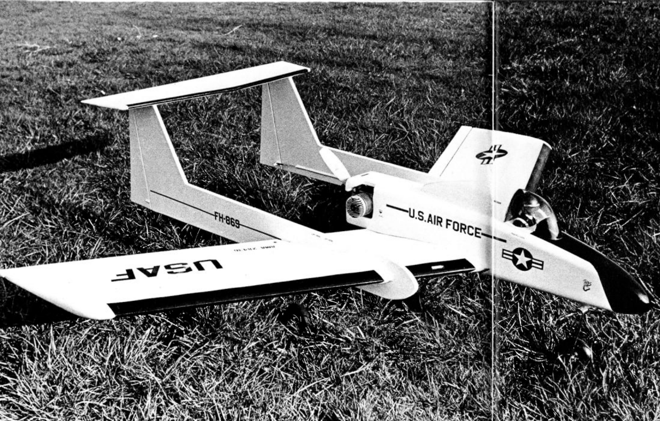
Dr. Brown's Invictus is not only unusual in appearance, but easy to build. Aerodynamically sound, it will do the complete AMA and FAI patterns as well as the more conventional multi aircraft.