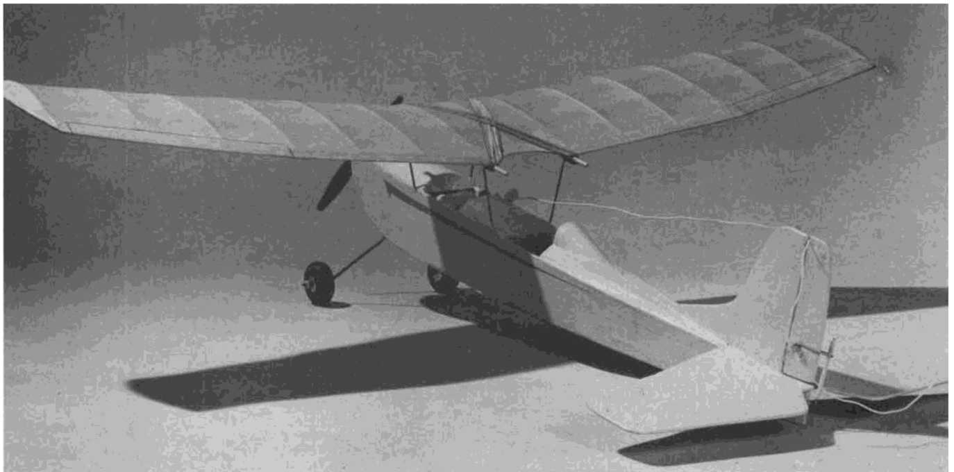
The little '30's Sportster should provide many hours of inexpensive R/C flying fun. Just think of how many flights you could get from the 12-ounce tank you have to stick in that 60 guzzler.

Pull the two sides together at the back end and install all other bulkheads. Bend the wing cabane struts from 1/16 music wire. Note that there is a 1/16 difference in height between the aft and forward strut sets, providing about 1° of positive wing incidence. Bind the struts to the 1/8 ply cross pieces and epoxy them into the fuselage, bracing with 1/8 balsa gussets.