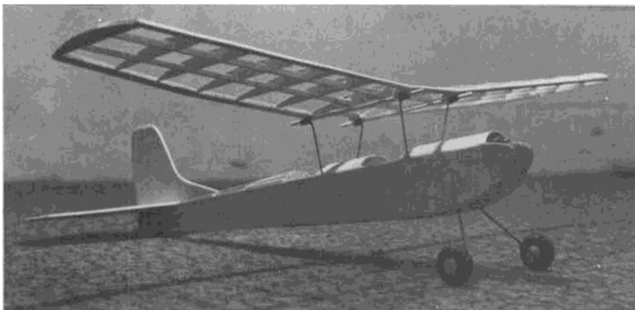
The 28 inch span Sportster looks very much like its 14 inch span, rubber powered descendant. It's also just about as easy to build.

The 1/8 ply firewall with blind 2-56 nuts can be installed next, again using plenty of epoxy. In fact, I make it a habit to coat both sides of the firewall to prevent fuel soaking into the plywood. Install the firewall with 0° and downthrust, unless you must install a super-hot engine. In which case, add a couple of degrees of down and right thrust.